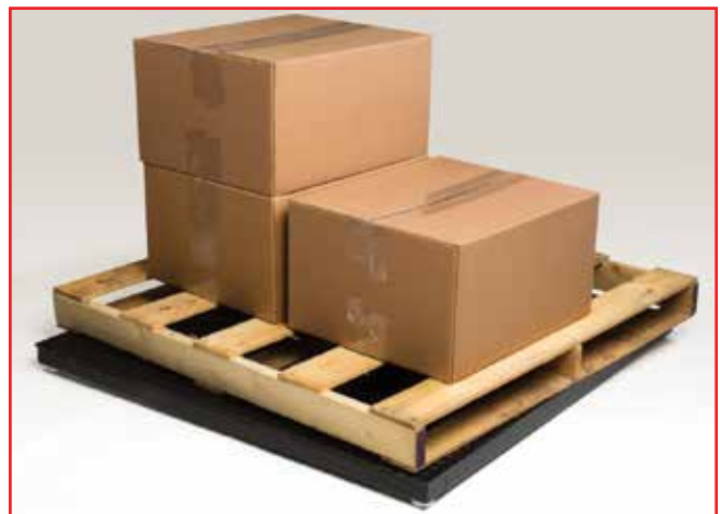
6600 mild steel model pictured.

The parts and components of these Pennsylvania Scale Company products are warranted for five years from the date of retail delivery against defects in materials and workmanship, subject to the terms and conditions of our standard warranty.