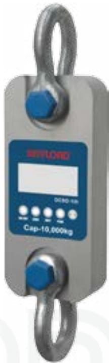
* shackles & indicators optional