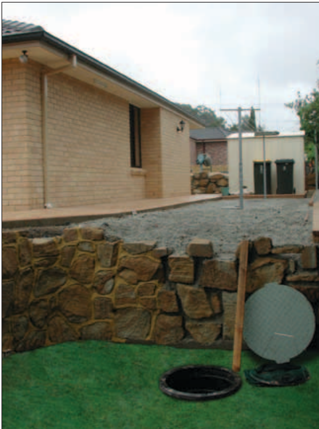
An Atlantis ® Filtration Unit installed into the garden area.

The Flo-Screen ® filtration units are designed to screen and filter gross pollutants, such as vegetation matter and silt from roofs and stormwater pits to ensure clean filtered water enters the Atlantis tank system.