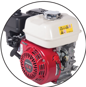
Honda GX160 Engine

A world leading Interpump direct drive pump powered by an ultra reliable Honda GX petrol engine ensures the Evolution 1 has a long & trouble free life.