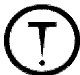
D2B - Toxic

WHMIS Hazard Class D2B - Toxic materials, Eye irritation Class E : Corrosive to aluminum. Not corrosive to animal skin or carbon steel.