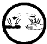
E - Corrosive