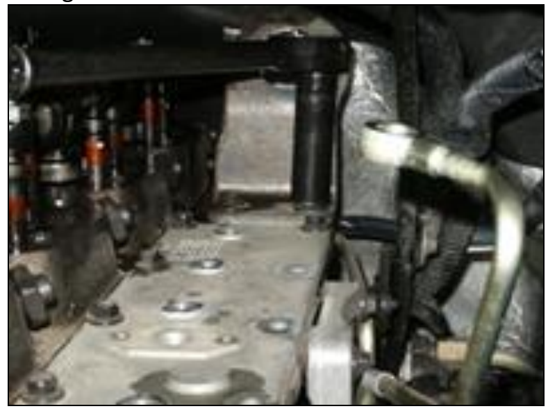
20. Remove 24mm nuts holding high pressure connector tubes.

19. Remove 15mm rear engine lift bracket bolts and bracket.