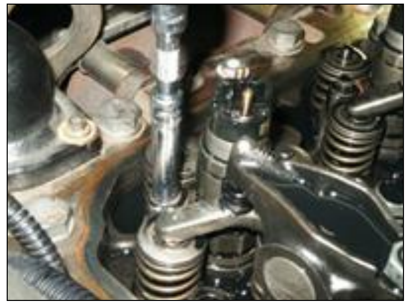
23. Carefully pry injectors out of injector bore.