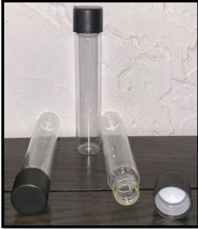
PHOTO: 18mm CR Closures