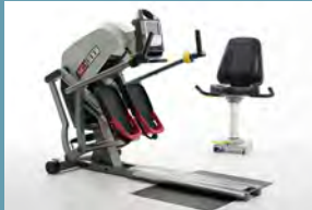
Removable seat and optional wheelchair platforms for easy wheelchair access.

The low impact StepOne recumbent stepper provides a smooth, total body functional exercise. StepOne features low starting resistance, wheelchair access, natural movement and a step range that provides patterning similar to walking or climbing stairs. The belt drive provides a smooth, quiet workout.