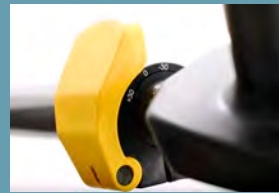
Rotate hand grips within a 60 degree range.