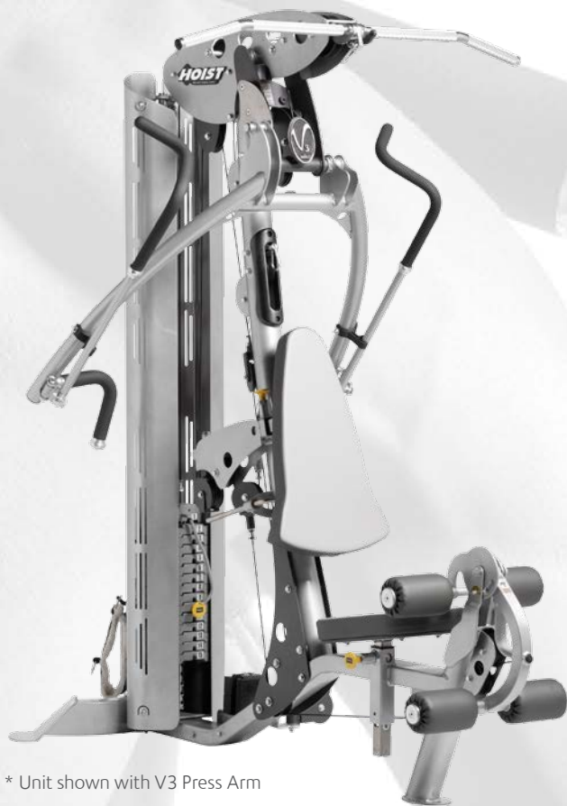
* Unit shown with V3 Press Arm