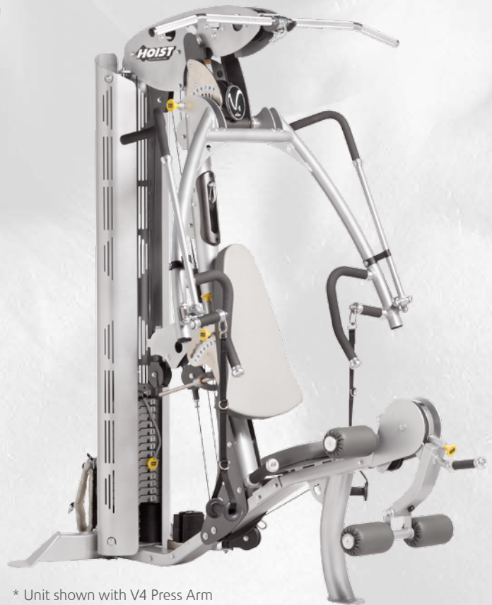
* Unit shown with V4 Press Arm