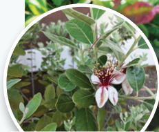
Pineapple Guava $8.50 | 1 gal $24.50 | 5 gal