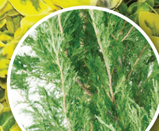
Juniper 'Spartan' $95 | 15 gal