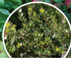
Manzanita 'Emerald Carpet' $7.50 | 1 gal