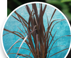
Flax 'Mat's Merlot' $25 | 3 gal