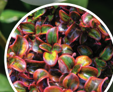
Coprosma 'Tequila Sunrise' $9.50 | 1 gal