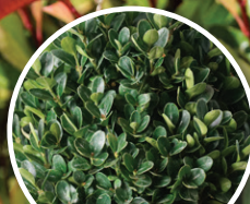
Dwarf English Boxwood $9.50 | 1 gal