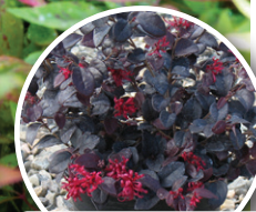
Fringe Flower 'Chang Nian Hong' $25 | 2 gal