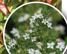
Myoporum 'Putah Creek' $7.50 | 1 gal