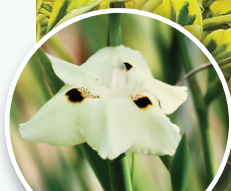
Fortnight Lily $6.75 | 1 gal $19.50 | 5 gal