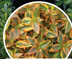
Abelia 'Kaleidoscope' $12.50 | 1 gal