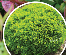
Mock Orange 'Wheeler's Dwarf' $6.75 | 1 gal