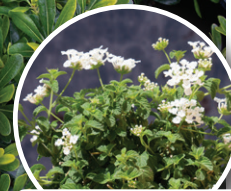
Lantana 'Trailing White' $5.50 | 1 gal