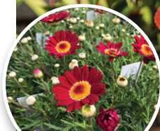
Marguerite Daisy $5.95 | 1 gal