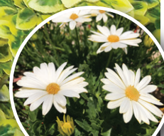
African Daisy $5.95 | 1 gal