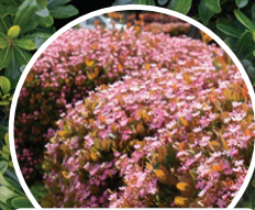
Indian Hawthorn 'Pink Dancer' $6.75 | 1 gal