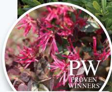
Fringe Flower 'Jazz Hands Bold' $21.50 | 01T