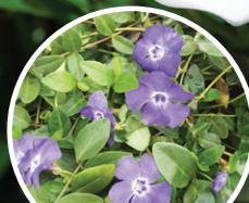
Periwinkle 'Bowles Mauve' $6.75 | 1 gal