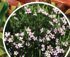
Breath of Heaven $19.50 | 5 gal Monrovia priced higher.