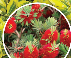
Bottle Brush 'Little John' $9.50 | 1 gal