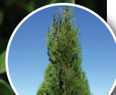
Thuja 'Emerald Green' $26.50 | 5 gal