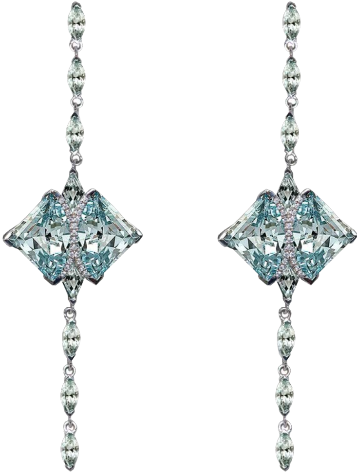
The Aquamarine Eagle Ray Earrings