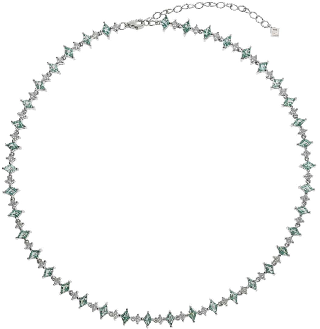
The Harlequin Choker