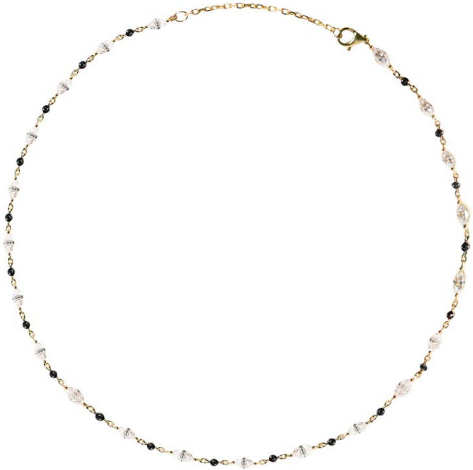
The Diamond Constellation Choker