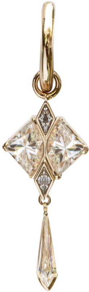
The Eagle Ray Charm