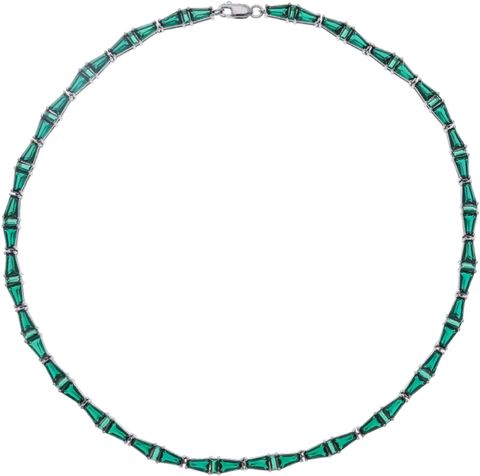
The Emerald Choker