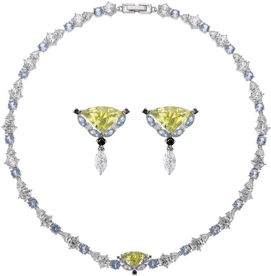
The Amethyst Choker & Earrings