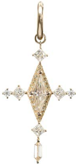
The Cross Earring & Charm