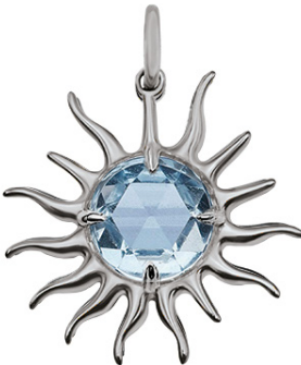
The Sun Pendant