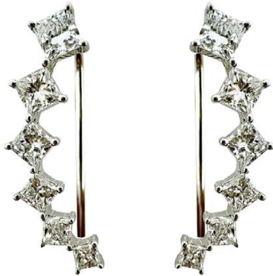
The Diamond Ear Climbers