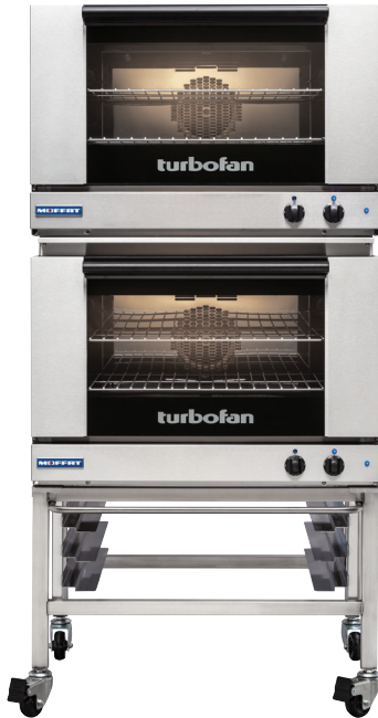
Model E27M2/2C shown

Double Stacked on a Stainless Steel Base Stand