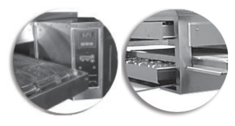
Removable panels for easy cleaning