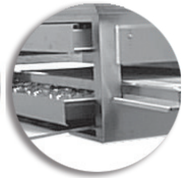
Removable panels for easy cleaning