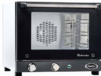
XAF 003 - Roberta