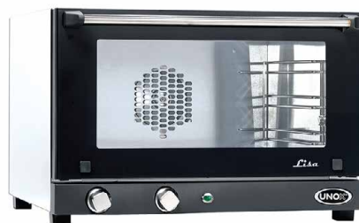
XAF 013 - Lisa