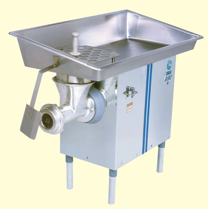
HHP Model 548SS Shown.

The Biro HHP (Heavy Horse Power) Meat Grinders are a series of manual feed grinders with a range of bowl sizes and motor sizes that can be tailored to meet your grinding needs. With bowl sizes of 48, 52, or 56 and motor sizes of 5, 7.5, 10, or 15 hp (3.7, 5.6, 7.5, or 11.2 kw), we can provide a grinder that is just right for your application. All of the HHP series grinders feature single - reduction chain drive transmissions for maximum efficiency, and all the grinders use tapered roller bearings for low maintenance and long life. The HHP grinders have output capacities ranging from 1500 lbs. (680 kg) per hour to 7500 lbs. (3402 kg) so you can pick the model that fits best.