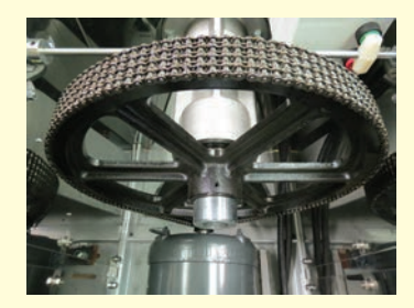
Biro exclusive non-slip chain drive transmission.

BIRO MANUFACTURING COMPANY 1114 WEST MAIN STREET