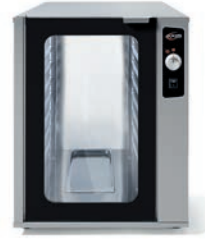
AX-PR5 SHIP WT: 133 lbs