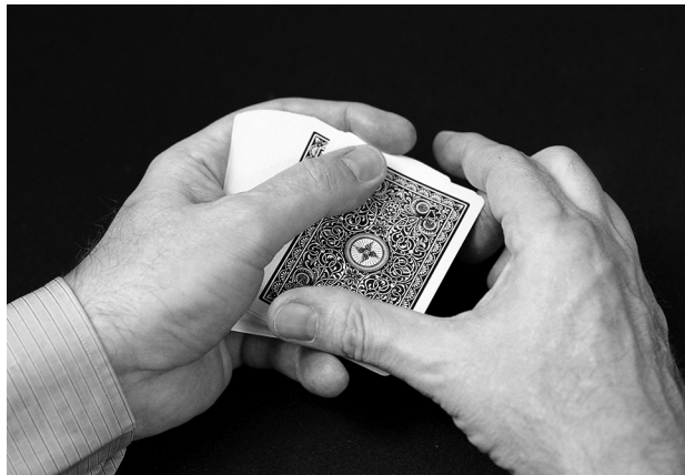
photo 445 - take starts with the right thumb at back end

For a favorite method, I like a short pushoff from a straddle grip. The right fingers approach the pushed off cards at the front right corner of the deck as the right thumb starts over the left back corner. In a continuous dealing action, slide the right thumb across the back of the top card from the back corner to the front corner in a swiping motion, eventually taking the second card between the tips of the right second finger and thumb for the deal. Once the second card clears the deck, deal it down to the table, pitch it, or deal it face up.