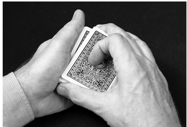
photo 276 - squaring up

With practice, the correct speed, smooth movement from right to left, and careful attention to your angles, your repertoire will include one of the fastest shifts possible.