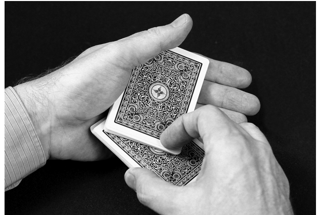
photo 274 - hands come together to initiate spin