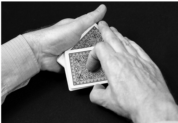
photo 275 - spinning action almost complete