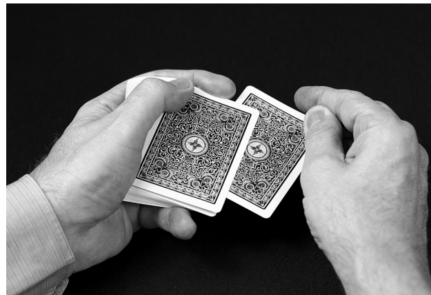
photo 448 - taking second card by front right corner