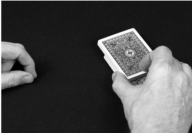
photo 273 - carrying the cut

Again, the deck is cut and carried with the bottom half stepped forward about one inch on the top half. The body is facing to the right and the left arm rests on the table. The left hand rests at least six inches away from the deck. The instant the cut is carried and contacts the other half, the right hand picks up the stepped deck and moves to the left to meet the waiting left hand as the body turns forward. Move the deck into the left thumb, jamming the upper stepped half into the thumb crotch. The force of jamming the deck into this position will automatically force the lower half to spin counterclockwise due to contact movement and clear the upper half. Square the halves with cover from the right hand, held over the deck, fingers at the front and thumb at the back. The deck, hands, and body should now be leaning to the left for the deal.