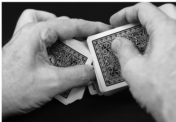
photo 176 - riffle and place left thumb between halves

As the halves drop to the table, loosen your grip and let the cards haphazardly fall. Push the top half under the bottom half and make a few casual squaring actions. For my favorite handling, make the final squaring action as you move the deck to the right, grabbing the right side and presenting the deck for the cut. Note that the method as described cuts the deck (perfect for laying briefs). To carry a full deck, start with the deck in the left hand. The bottom card does not change, which is fine provided it changes at least once during the entire shuffling procedure.