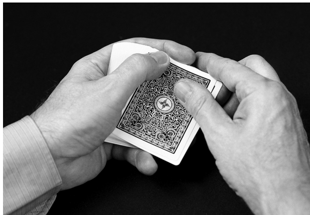
photo 447 - swiping across entire card