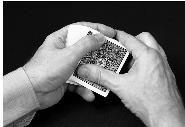
photo 446 - beginning of swiping action