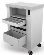
ROLLING MEDICAL CART | $2,750

QWS4824P: Medical grade wire shelving, powder coated in antimicrobial paint, color: Light Green, durable, up to 800 lbs. load capacity, caster wheels.