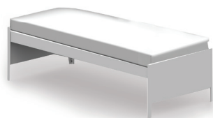
EMERGENCY COT | $470.70

Short-term bed, 36" x 80", no-tool assembly, 400 lbs load capacity, adjustable height, FDA registered 6" high-density foam mattress included, fluid-proof nylon fabric, sanitizable, limited life time warranty on bed frame, 5-year warranty on mattress.