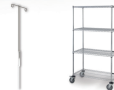
TEMPORARY BED/COT IV HANGER | $90.00

FDA registered 6" high-density foam mattress, fluid-proof nylon fabric, sanitizable, 5-year warranty.