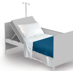
QUIK INCLINE BED KIT | $1,029

Bedside cabinets provide convenient storage within easy reach. Built for the specific needs of healthcare users, bedside cabinets perform equally well in medical, surgical or long-term care environments. Antimicrobial powder coat painted surfaces available in 31 colors, laminate tops available.