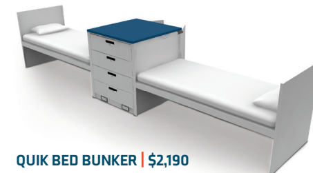
QUIK BED BUNKER | $2,190

Quik Incline Bed Kit includes a standard Quik Incline Bed 36" x 80", FDA registered 6" high-density foam mattress, wipeable and sanitizable surface, antimicrobial paint, IV Hanger, and a set of Quik-Lok® side rails, limited life time warranty on bed frame, 5-year warranty on mattress.