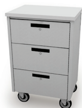
ROLLING BEDSIDE MEDICAL TABLE | $965

Dual sided, lockable security drawers, file drawers, 3 pullout drawers, laminate countertop workspace, on casters.