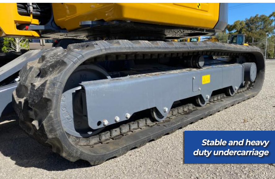
Stable and heavy duty undercarriage