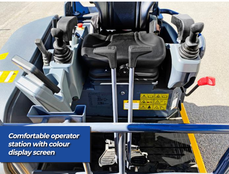
Comfortable operator station with colour display screen