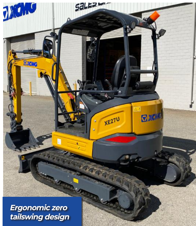
Ergonomic zero tailswing design