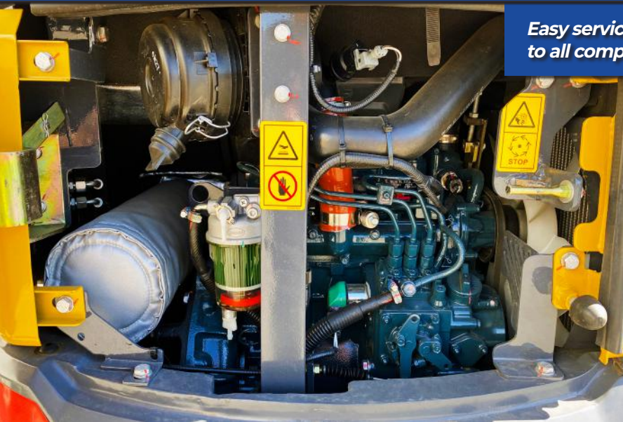
Easy service access to all componentry