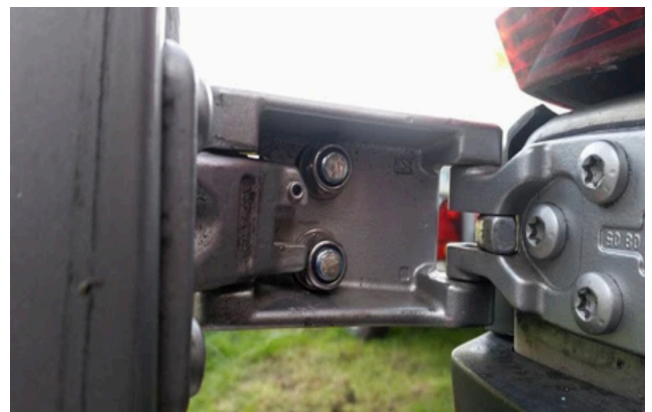
Above is a photo of a hinge with the bar removed.