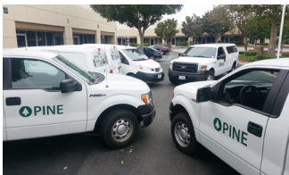
Local Delivery Pick-up

You can rely on Gastec quality. Gastec systems are designed, manufactured, and calibrated to work together so you know you are getting accurate readings. Gastec operates an ISO-9001 certified facility.