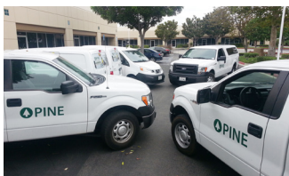
Local Delivery Pick-up