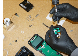
Repair & Calibration