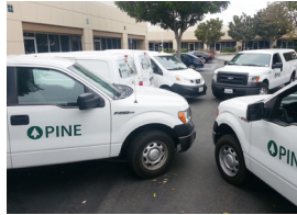
Local Delivery Pick-up