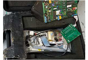
Rental Protection Plan