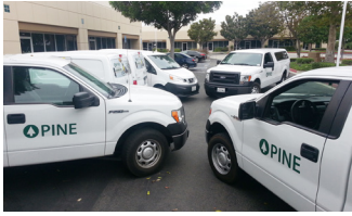
Local Delivery Pick-up