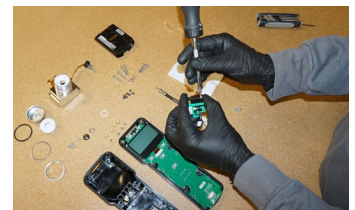
Repair & Calibration