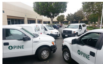
Local Delivery & Pick-up