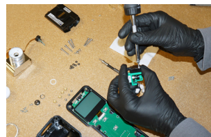
Repair & Calibration