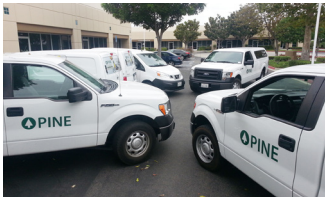
Local Delivery Pick-up