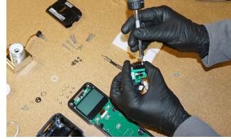
Repair & Calibration