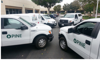
Local Delivery Pick-up