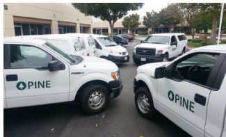
Local Delivery Pick-up