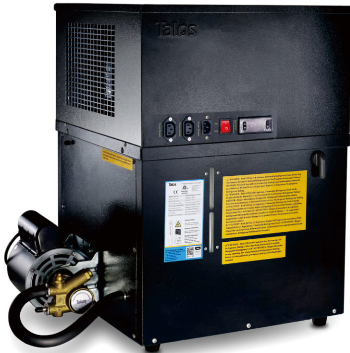
Power Pack 1-pump 1085576

fast action cooling with advanced temperature control and high efficiency pressure system designed for long distances in variable directions.