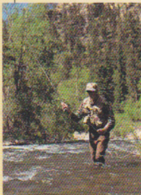
SOUTH DAKOTA TOURISM