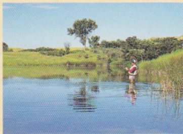
KEVIN ELLERBE PHOTOGRAPHY