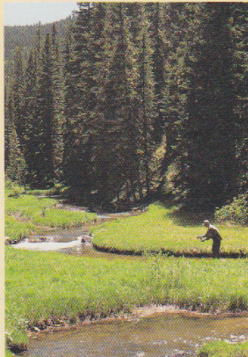
SOUTH DAKOTA TOURISM

NOTE: The streams and ponds in the watersheds north of Interstate 90 are outside of the Black Hills Fire Protection District. Permission is required to trespass on all private lands North of Interstate 90.