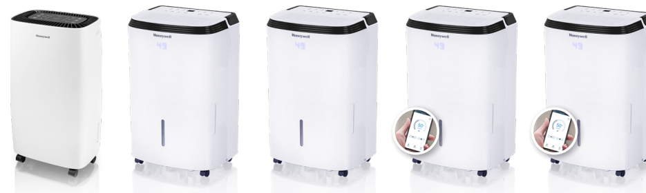
TP Compact 12 L / 24 h 1