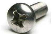
PHILLIPS HEAD SCREW