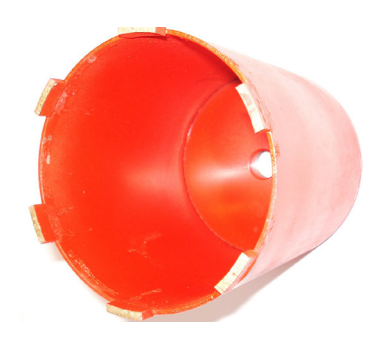
Can be slotted or Solid for Spoil removal & Dust Free Drilling

We Have the largest selection of Dry Diamond Core Bits for Block and Brick including Engineering Brick and some poured concretes.