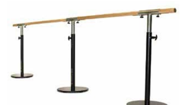
Stability Barre - 12 ft gray