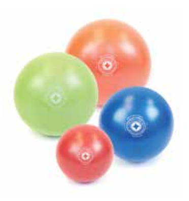
Mini Stability Ball™ XSmall ST-06215 Small ST-06045 Medium ST-06115 Large ST-06116