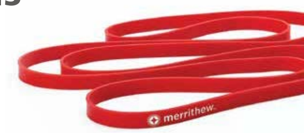
Resistance Loop™ Regular strength (red) ST-06193