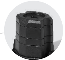
Adjusts from 3.5-18 kg.