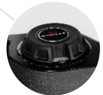
Weight Selection Dial