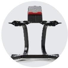
Stand With Media Rack