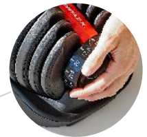
Weight Selection DIALS