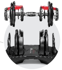
Adjust from 2 to 24 kg.