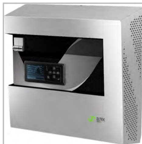
CTO30210.XXX FLATPACK2 WALLBOX - A 2 RECTIFIERS SYSTEM