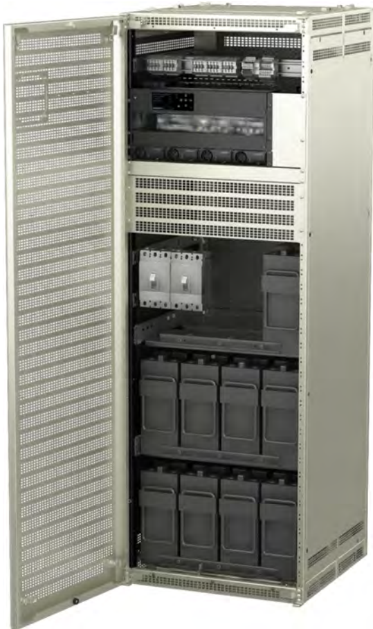
IBB SYSTEM IN FPC CABINET