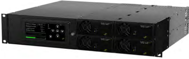
2U FLATPACK2 BULK OUTPUT RACK WITH EARTH FAULT DETECTION