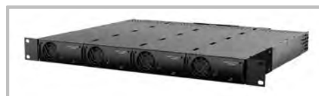
FLATPACK2 POWER RACK FOR HVDC(PN: 268035)

VARIOUS OTHER APPLICATIONS IN DEMANDING INDUSTRIES LIKE MARINE, OIL & GAS, PROCESS ETC.