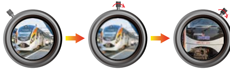
Vari-focal lens for available focal lengths

The ICA-5250V incorporates the mega-pixel vari-focal lens, which has the options of selecting a high millimeter setting for narrow viewing fields or a low millimeter setting for wider viewing fields. The ICA-5250V provides three individually configurable motion detection zones. The camera can record video or trigger alarms or alerts when camera image is tampered.