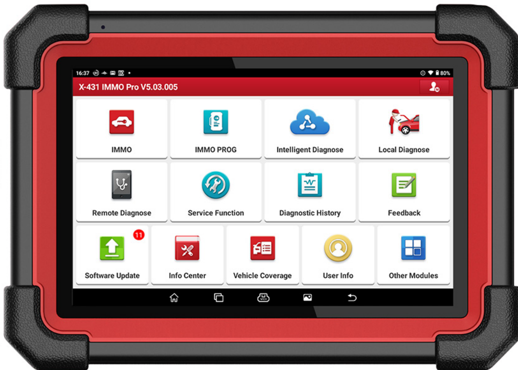
X-431 IMMO PRO