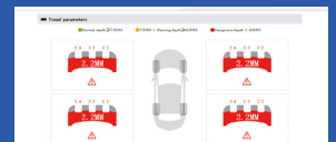
Instant measurement & high accuracy