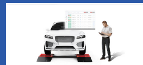
Drive over tire tread depth scanner