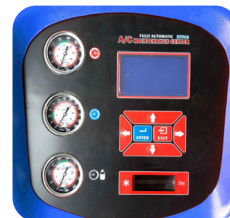
Friendly Interface Run by Hot Key