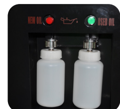
Oil Injection Controlled by Switch