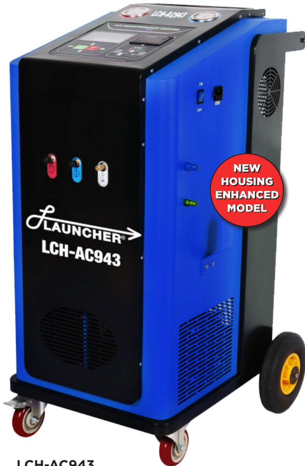
LCH-AC943 (for R134-A gas)