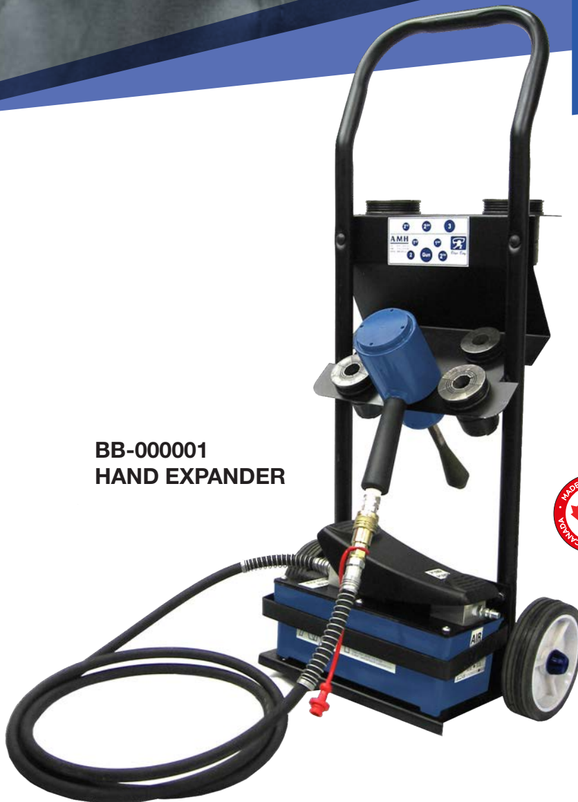
BB-000001 HAND EXPANDER