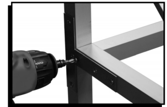
Figure 2 Attaching Foot to Leg