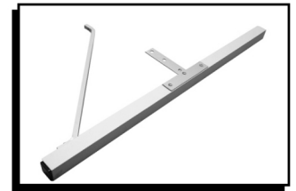
Figure 1 Right Foot with Brace