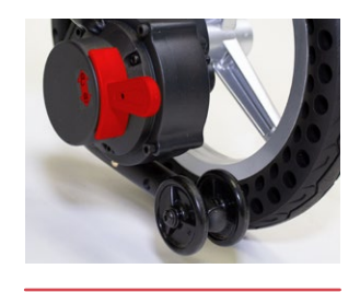
When powered off, freewheel (push) mode can be utilized and the wheels turn freely