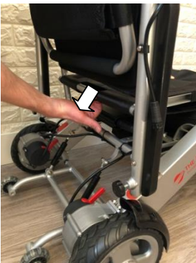
5. Pull cable