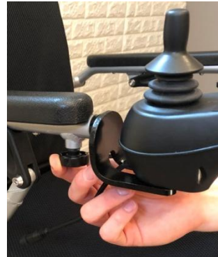
2. Tighten Knob