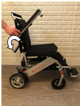
2. Rotate arm rests