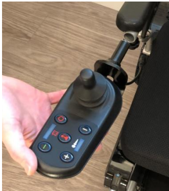
1. Slide in Controller