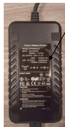
Back of Charger with definitions of what the light colors mean.