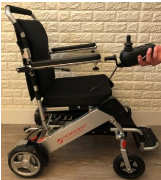
1. Unplug and remove