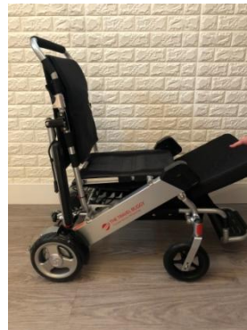
3. Store cushion