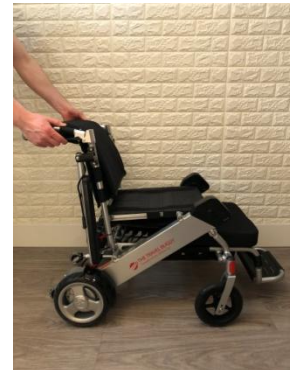
4. Squeeze levers and fold back rest down