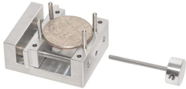
closed position with pushrod in place