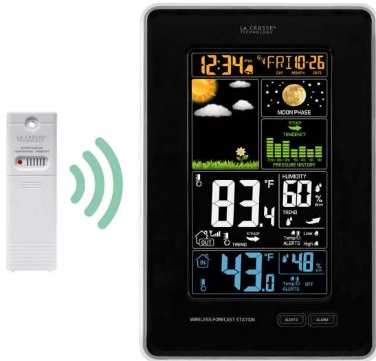
Model: 308-1425B DC:110617