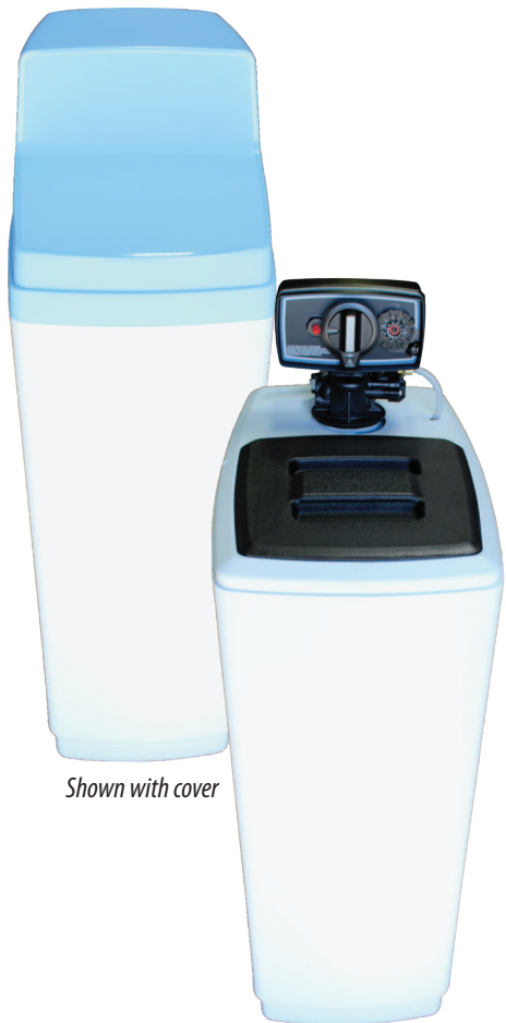
Shown with cover